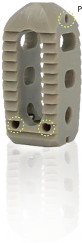
Pin to review X-Ray